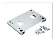
Raised foundation plate included.

The intensity with which it can be used is guaranteed by a number of design details regarding the self-cooling system and the finned motor.